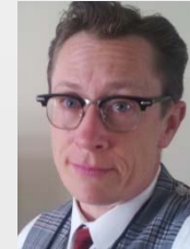
Scout Fenway Institute